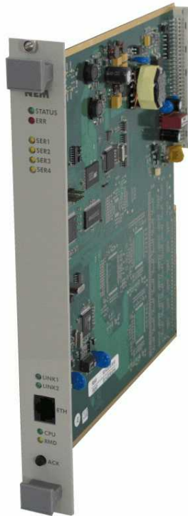
Figure 1. – NEM

The NEM card is a connection device between the NEs and client software (Monitor program) and uses real-time multi-tasking OS with TCP/IP protocol stack. It can be plugged-in to the rightmost (14 th ) slot of the SBR-14 sub-rack (see document GenDesc SBR v1.0 ).